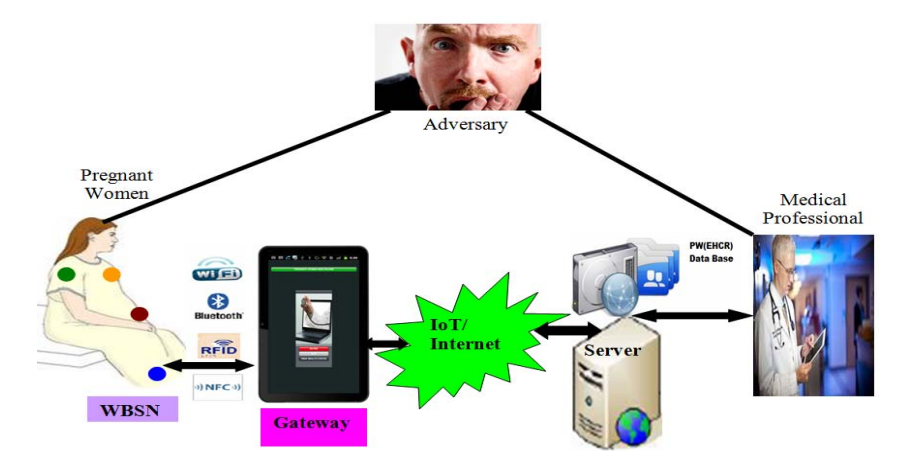
Figure 3. Pregnant Women Healthcare and PrivayConcern

It is fact that Internet of things and other advanced technologies have huge potential in pregnant women healthcare system and medical service to advance pregnant women safety inside the clinic and outside, healthcare services and also reforms the future of our medical atmosphere. Furthermore, the speedup privacy & ethical issues of pregnant women which we analyze in this section;