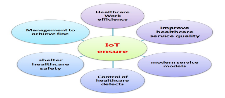
Figure 2. Potential of IoT in Pregnant Women Healthcare

The main actors in this system are pregnant women, gynecologist, body sensors and pregnant women electronic healthcare information databases with web server. Healthcare relevant information and events are sent via Wireless Body Sensor Network (WBSN) with Zigbee and Bluetooth to the pregnant women smartphone(Gateway), pregnant women EHCR in the distributed database through Internet; EHCRs can be accessed from anywhere and at anytime by gynecologist, pregnant women and other related healthcare actors are permitted to consult them.