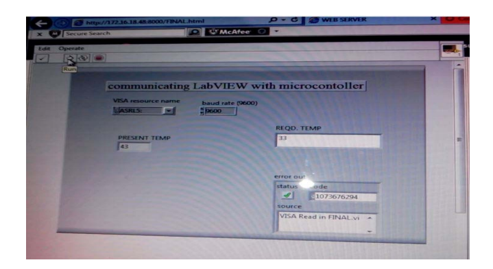
Figure 5. Output from the web server

Thus by using the web, the parameters involved in home automation are monitored and controlled by interfacing the microcontroller and remote front panel.