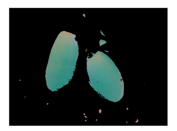
Figure 6. Segmentation Image with Fixed Threshold