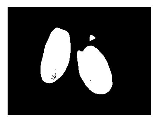
Figure 9. Result of Manual Segmentation