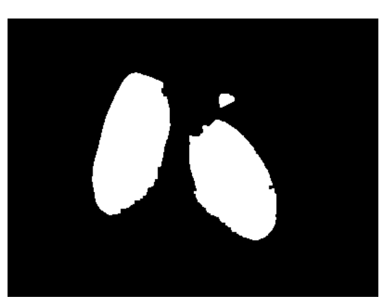
Figure 7. Processed Image with Mathematical Morphology