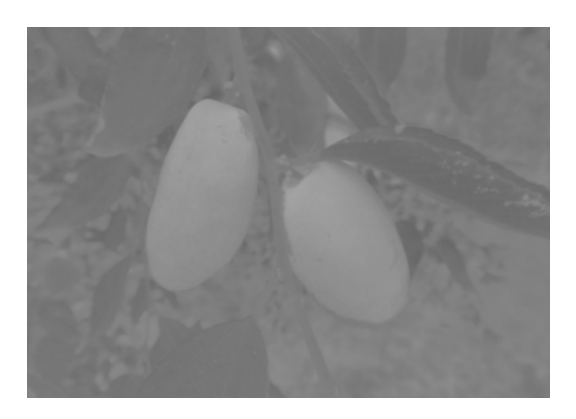
Figure 3. a^* Component Image