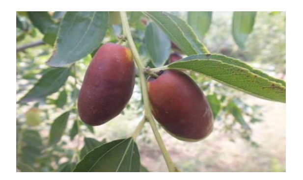
Figure 1. Lingwu Long Jujubes' Natural Image

The Lingwu long jujubes' images were taken by digital camera FUJIFILM under natural light conditions on a well sunny morning in Wan-Mu Zao-Yuan of Lingwu Daquan forest centre . 997 pieces out of 1665 taken photos were chosen in different circumstances such as touching, covering and shadow. 50 of the 997 pictures containing less than 8 jujubes were selected for further processing under JPG format. The initial images in resolution of 400 \times 300 pixels. The picture is shown as Figure 1.