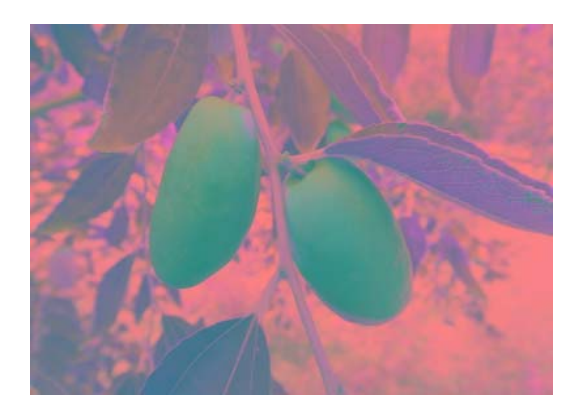
Figure 2. L*a*b* Color Space Image

the difference of color information of each color component in L*a*b* color space, it is obvious that mature jujubes' color is red and immature jujubes' surface is somewhat green-yellow; leaves of the trees are green; surface of branches and trunks is white and interior is red. Then the color of maturity and immaturity is respectively corresponding to a^* and b^* in L*a*b* color space. Each component in L*a*b* is obvious in 3D histogram shown in Figure 2 to Figure 5.