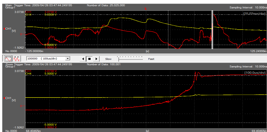
Figure 1. Cloud Flash

If the discharges happen inside a thundercloud or between thunderclouds, the terms intracloud flashes or cloud flashes (ICs) are typically used as shown in Figure 1. Cloud discharge is the most common of all types of lightnings [10]. ICs usually occurs between the center and the center of positive charge on the lower negative charge. Complete discharges has the order of 0.2 seconds during which time a continuous luminosity observed in the cloud. It is thought that during these periods the leaders spread narrowing the gap between the two centers responsible. Overlap in continuous flashes some quite bright light pulses that time period about 1msec. It would appear from the measurements of the electric field that pulses of light is relatively weak return stroke that occurs when passing acquaintance pockets leader is responsible for the polar opposite of a leader. The amount charged may be released intracloud neutralized in the same order of magnitude as the subject land is transferred in the cloud to be released. IC lightning still in the clouds and is the most common type of discharge [11].